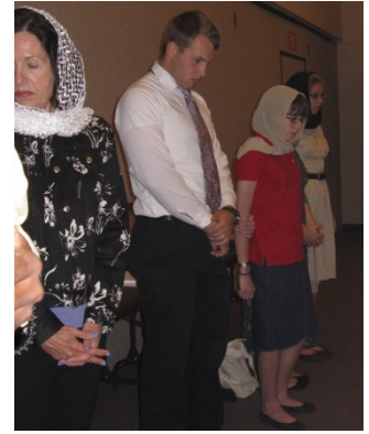
5: Sunday morning worship

Thank you for your continued support of this ministry, which is, by God's grace making a impact on the lives of its students and others. ACM is almost completely supported by individual Orthodox Christians like you. We wouldn't be able to continue this ministry without such faithful support.