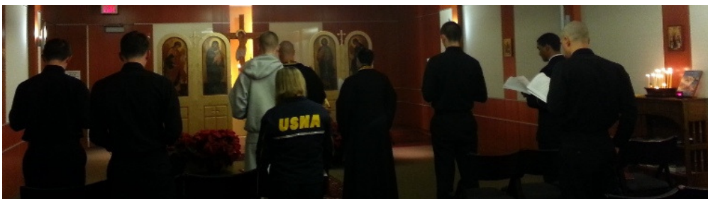
3: Akathist to St. Nicholas at USNA

In addition to individual meetings at AACC (Anne Arundel Community College), our second larger outreach took place in October just before we moved the mission's rectory to Annapolis. We're still unpacking as the demands of the ministry (and our baby and toddler) continue apace. We're so thankful to be closer to the students and the three campuses I serve as chaplain. It's made it much easier to use our home for ministry.