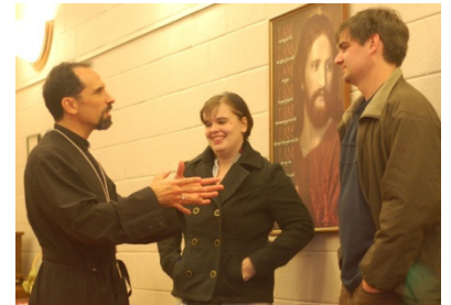
7: Reaching out to AACC students

Wishing you and yours a blessed Feast of the Nativity and Christ God's blessing in 2013,