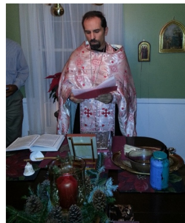
1: WE HAVE MOVED! New House Blessing and Christmas Caroling Party at the New Rectory

Christ is born! Glorify Him! What a blessing to write to you, our faithful ACM supporters, during this holy season of preparation for our Lord God and Savior's Nativity. We have so much to thank God for! I invite you to take a look below at the many happenings and blessings God has given us as He continues to work through this ministry to build up His Church, strengthen those already Orthodox, and bring others to the knowledge and love of Him.