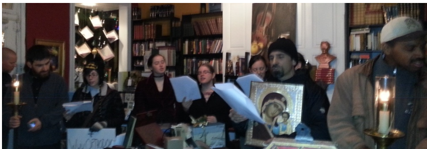
9: Caroling in Downtown Annapolis: In the Annapolis Bookstore